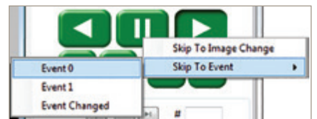
Figure 2: Skip to Event selector